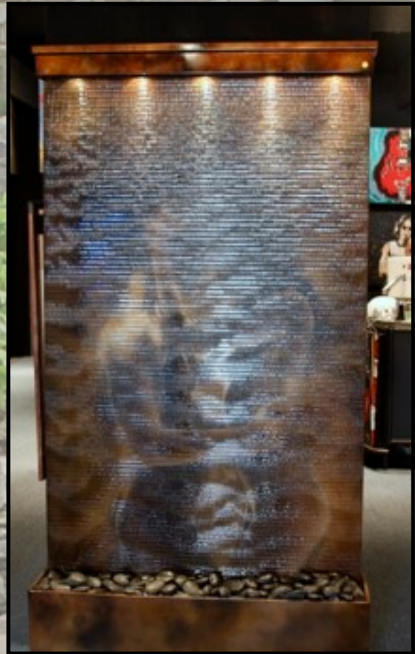
CUSTOM DESIGNED PRE-MANUFACTURED WALLS OF WATER