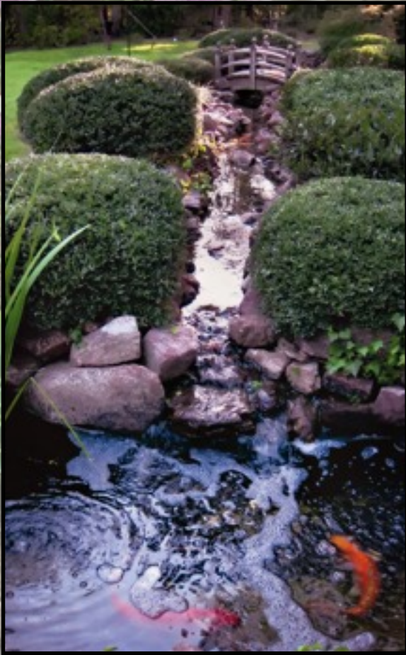
CUSTOM WATER GARDEN DESIGNS, INSTALLATION & PONDS